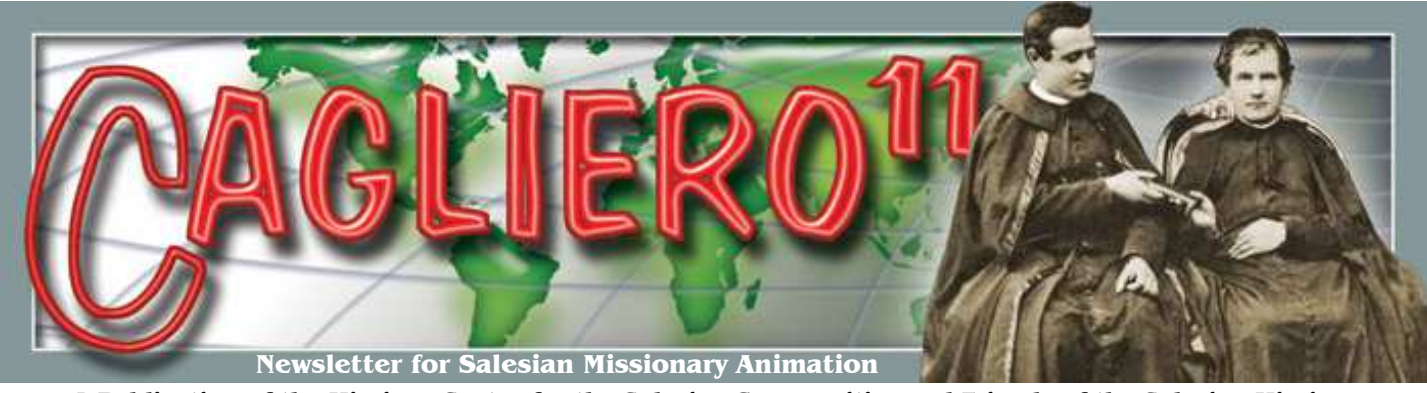
A Publication of the Missions Sector for the Salesian Communities and Friends of the Salesian Missions